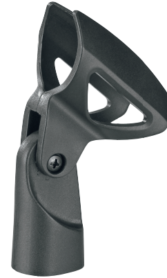
Detail of microphone holder