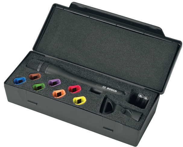
Protective case with wireless, handheld microphone and accessories